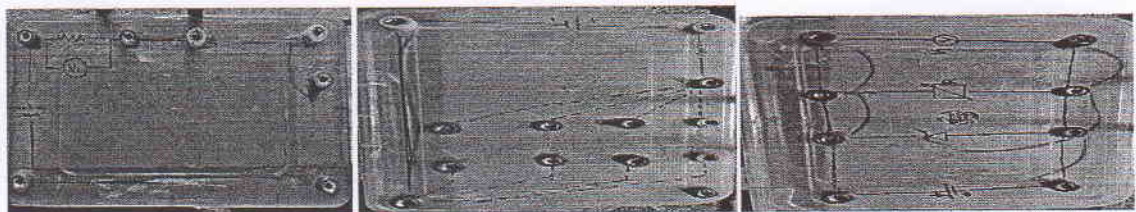
Kirchhoff Voltage law